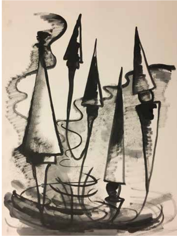
ABOVE: Spontaneously Occuring Airborne Clowns , 18 x 24", Oil on paper, 2017 OPPOSITE: Cisgenia , 48 x 48", Oil on canvas, 2017