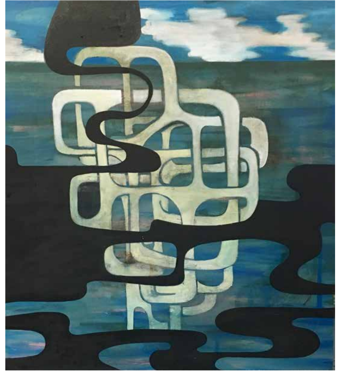
Soul (or Spirit) , 42 x 38", Oil on canvas, 2017