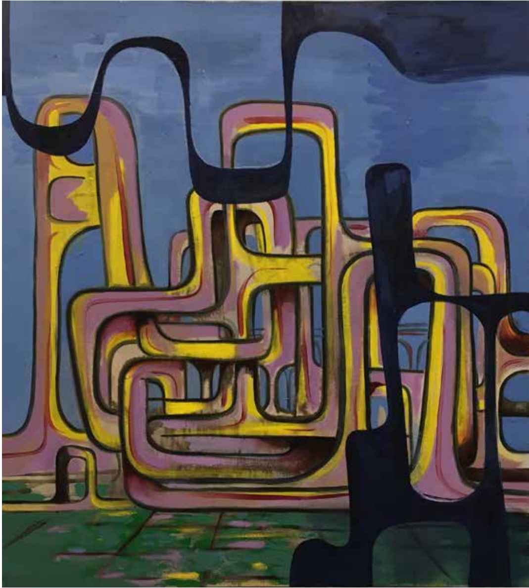
Espalier , 42 x 38", Oil on canvas, 2017