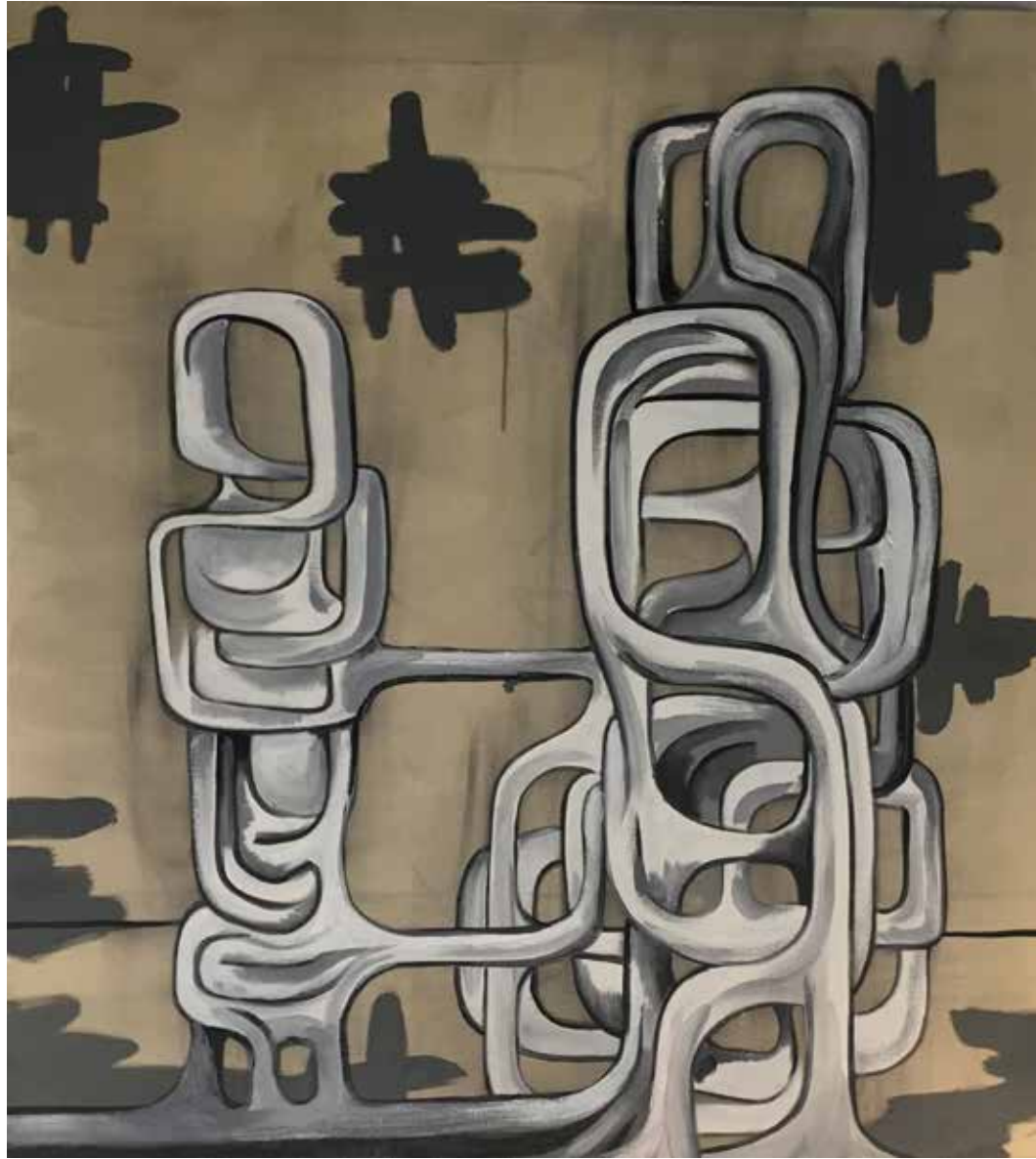
Interior, 42 x 38", Oil on canvas, 2017