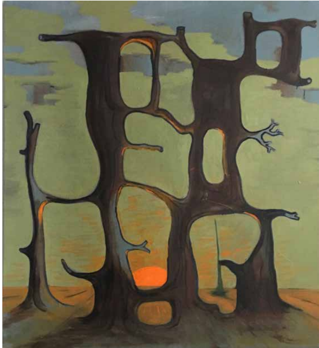
Anthropocene , 42 x 38", Oil on canvas, 2017